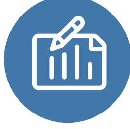
Pencil & Paper